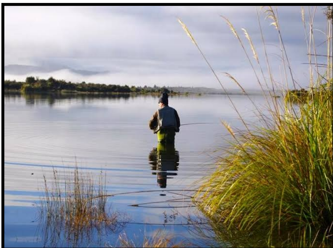
You don't have to have a boat to fish the Big O