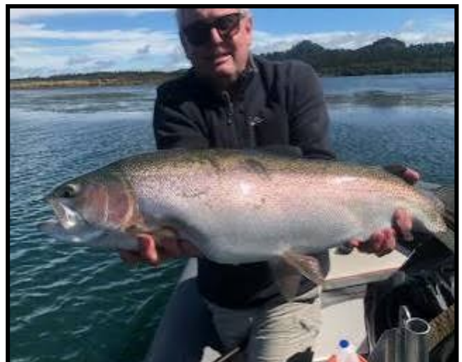
A happy angler with a stunning fish from the "Big O"