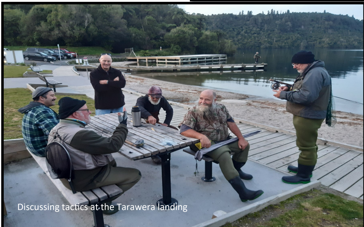
Discussing tactics at the Tarawera landing