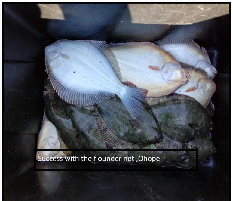
Success with the flounder net ,Ohope